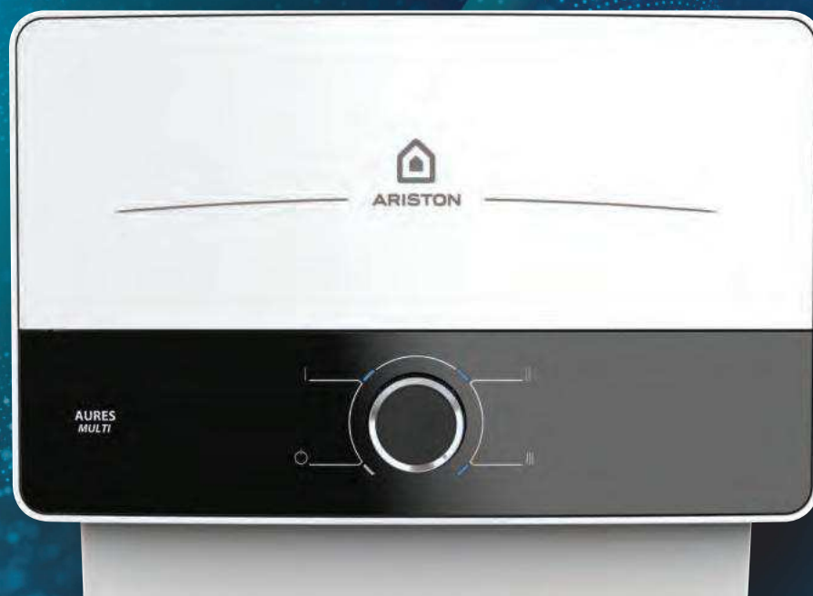
Aures Multi 9.5kW