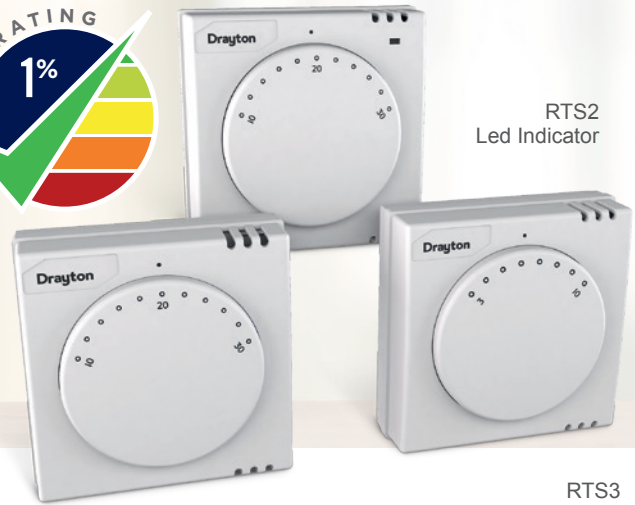
RTS2 Led Indicator